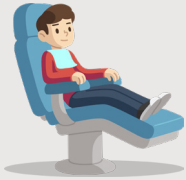
Cleanings and Exams